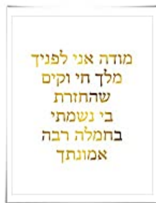
Modeh Ani Hebrew Art Print

The decision of the Jerusalem Council is similar to how we disciple new Christians in our churches and faith communities. Although we know there are changes they may need to make in their lives to follow Jesus, we don’t confront them with all of it on the day of their conversion. We know they need time to grow and will be led in sanctification by the Holy Spirit along their walk.